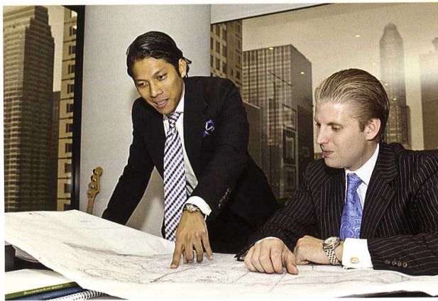
The Antonio-Trump partnership has so far garnered the Asia Pacific Property Awards 2012 as the Best Residential High-rise in the Philippines. Says Trump: "We are overwhelmed with the tremendous success of this project in such a short time. Having 70 percent of a project sold before breaking ground and even prior to opening a showroom speaks of the strength of the local market and its increasing demand in the ownership of luxury real estate. When it's finally completed in 2016 the project will be like nothing you've seen before."