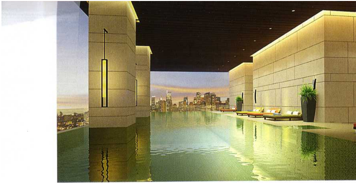
Amenities include a fine dining restaurant at the ground floor and a library, business center, lounge and video room on the third. Halfway up the tower on the 29th and 30th floors are the spa and fitness center, juice bar, sun deck and lap pool for the exclusive use of residents.